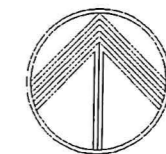
Ministerial Suite M1 23 - Suite Data Sheet