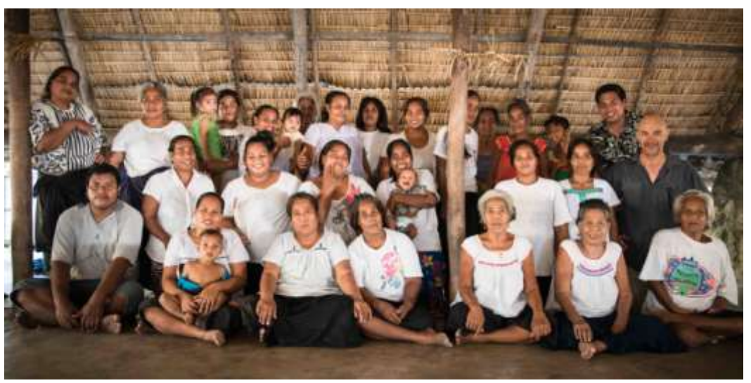
Community consultations on enabling rights with women's meeting on Maiana

Judicial outreach by the courts requires specific activities to engage with the community. It describes a communication process to build public understanding and trust in the work of the courts through public engagement and information. Supporting public information is also the subject of a separate PJDP toolkit: Public Information .