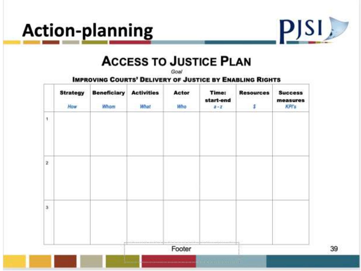
Enabling Right / Access to Justice Planning template