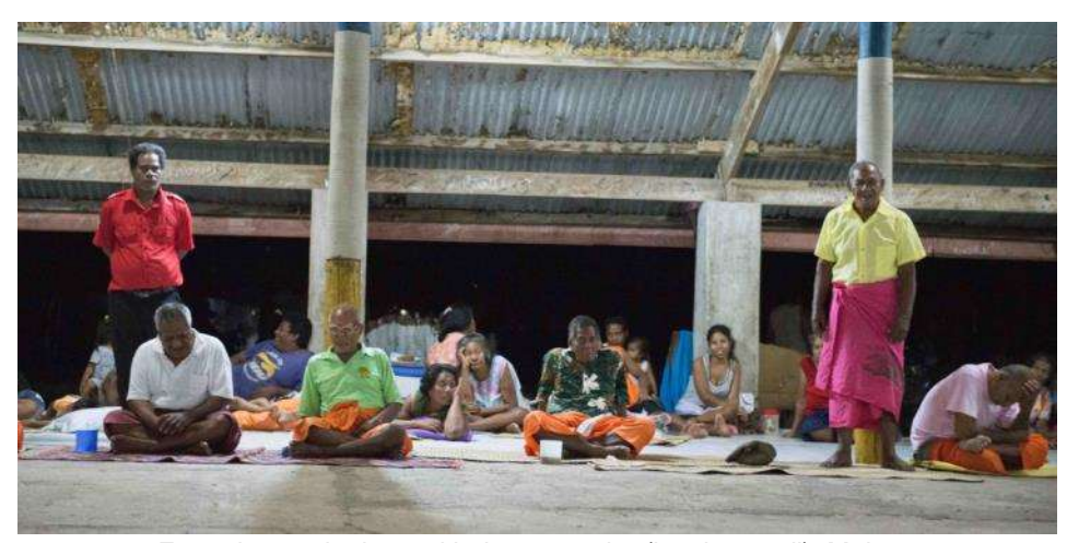
Formal consultations with the maneaba (local council), Maiana