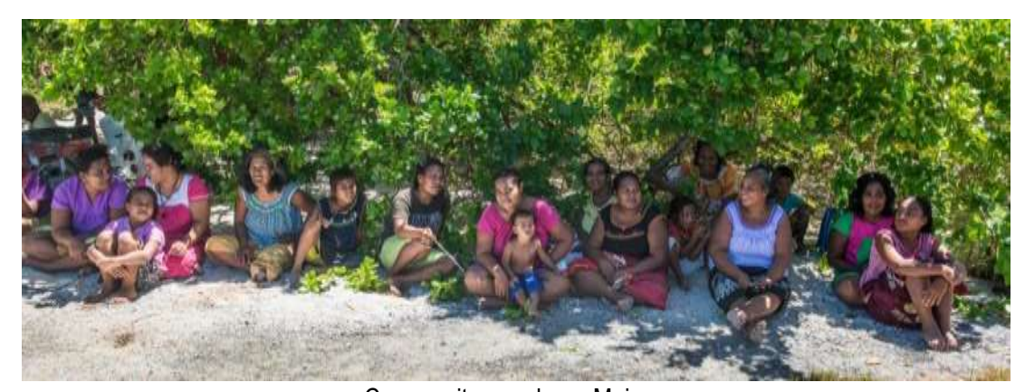
Community members, Maiana

This is a very substantial list - including each of us, at one time or another! 19