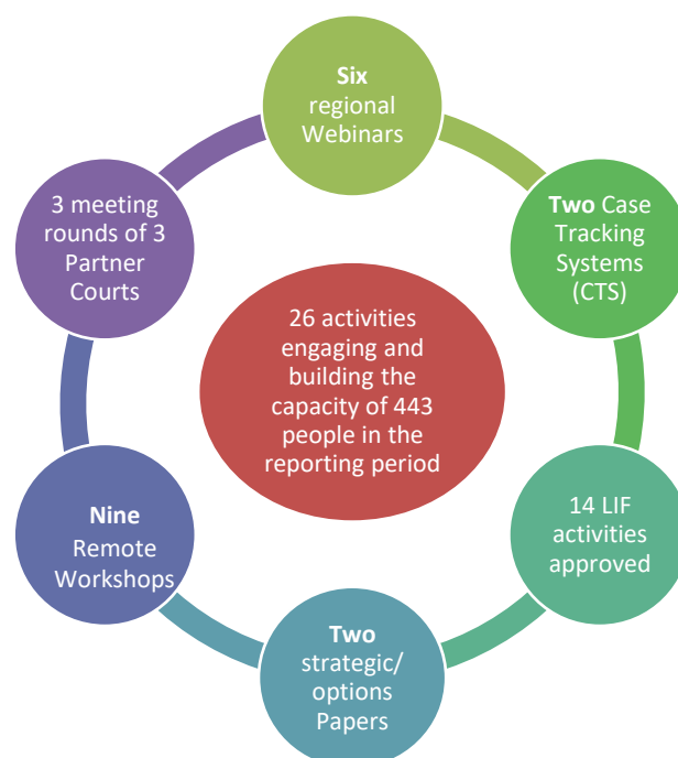
Diagram 1: Activities delivered during reporting period