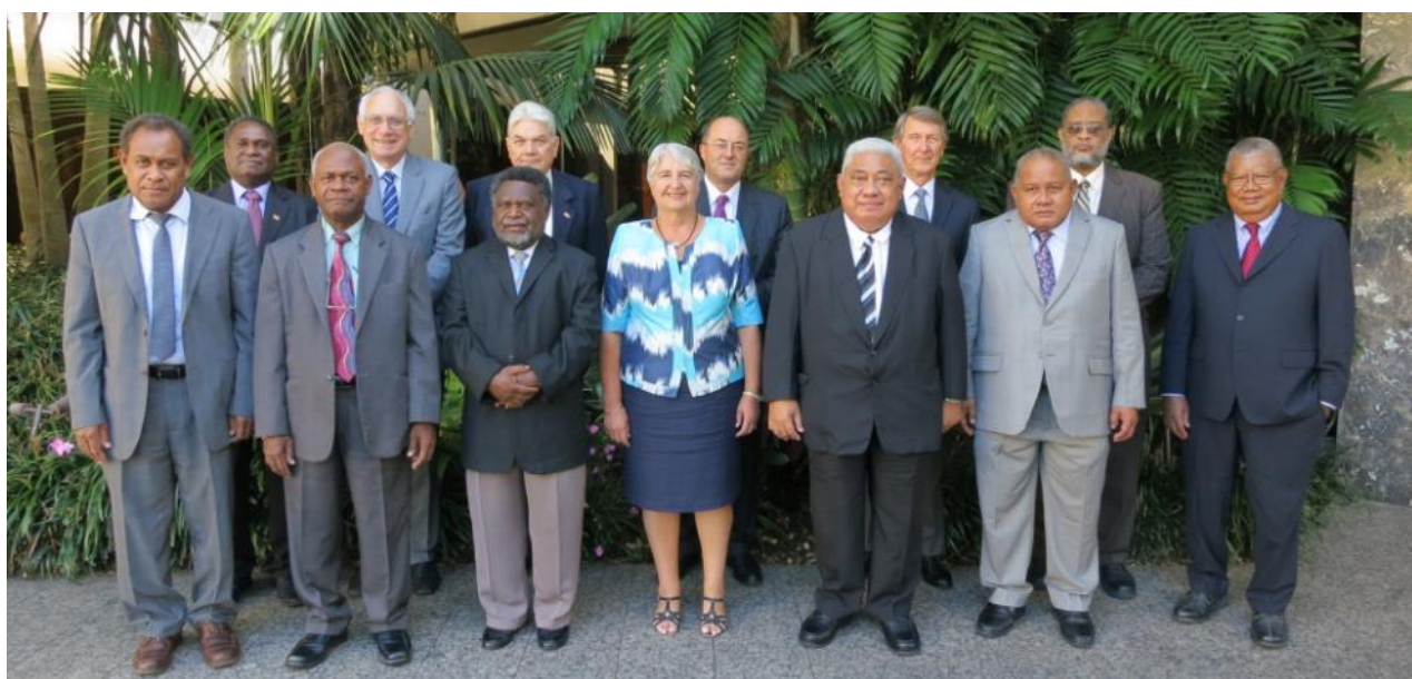
6 th Chief Justices' Leadership Workshop - Auckland, New Zealand: 6-8 March, 2014