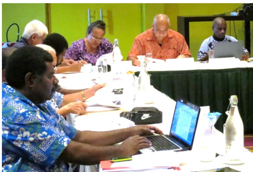
Above: Participants and facilitators at the Lay Decision Making Workshop