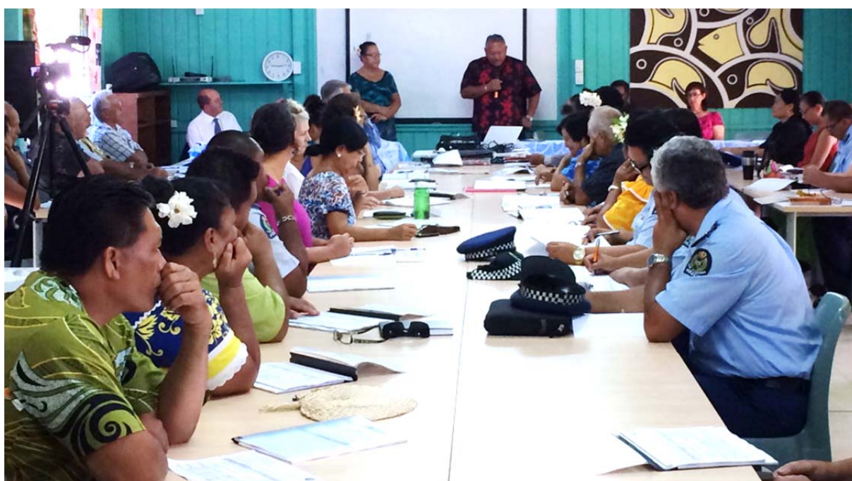
Above: Cook Islands Deputy Prime Minister Teariki Heather formally opening the workshop