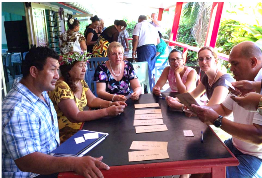
Above: Participants at the workshop during group activity

PJDP will visit the Cook Islands again in October 2014 to follow up on changes to how family violence and youth justice matters are being addressed.