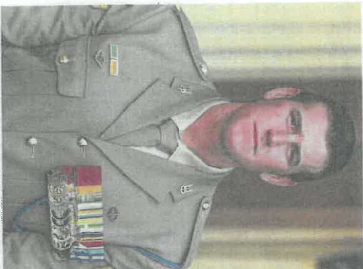
4. Mr Ben Roberts-Smith, who faces misconduct allegations, received the Victoria Cross in 2011 for bravery in Afghanistan.