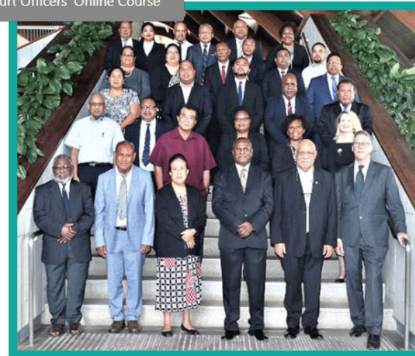
Participants of PJIP's inaugural Judicial Officers' Fraud and Corruption Workshop in Papua New Guinea, December 2022