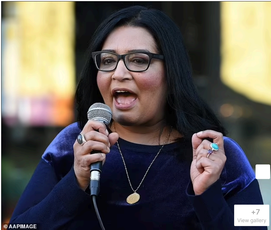
Mehreen Faruqi, who swore her allegiance to the Queen when she entered the senate representing NSW, explained why she will refuse to pay her respects in a tweet on Friday just hours after Her Majesty died

'We are reminded of the urgency of treaty with First Nations, justice and reparations for British colonies and becoming a republic.'