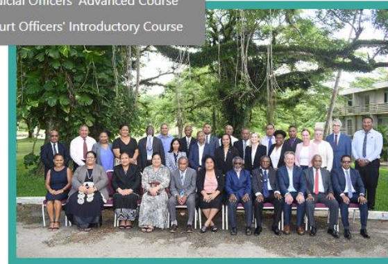
Participants of Advanced Judicial Officers' Fraud and Corruption Workshop in Port Vila, Vanuatu 2024.

Can't read the security key? Click here to get a new key.