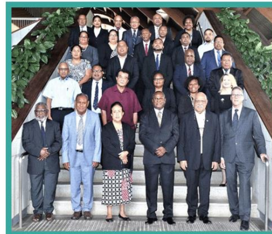
Participants of PJIP's Judicial Officers' Fraud and Corruption Workshop, Port Moresby 2022.