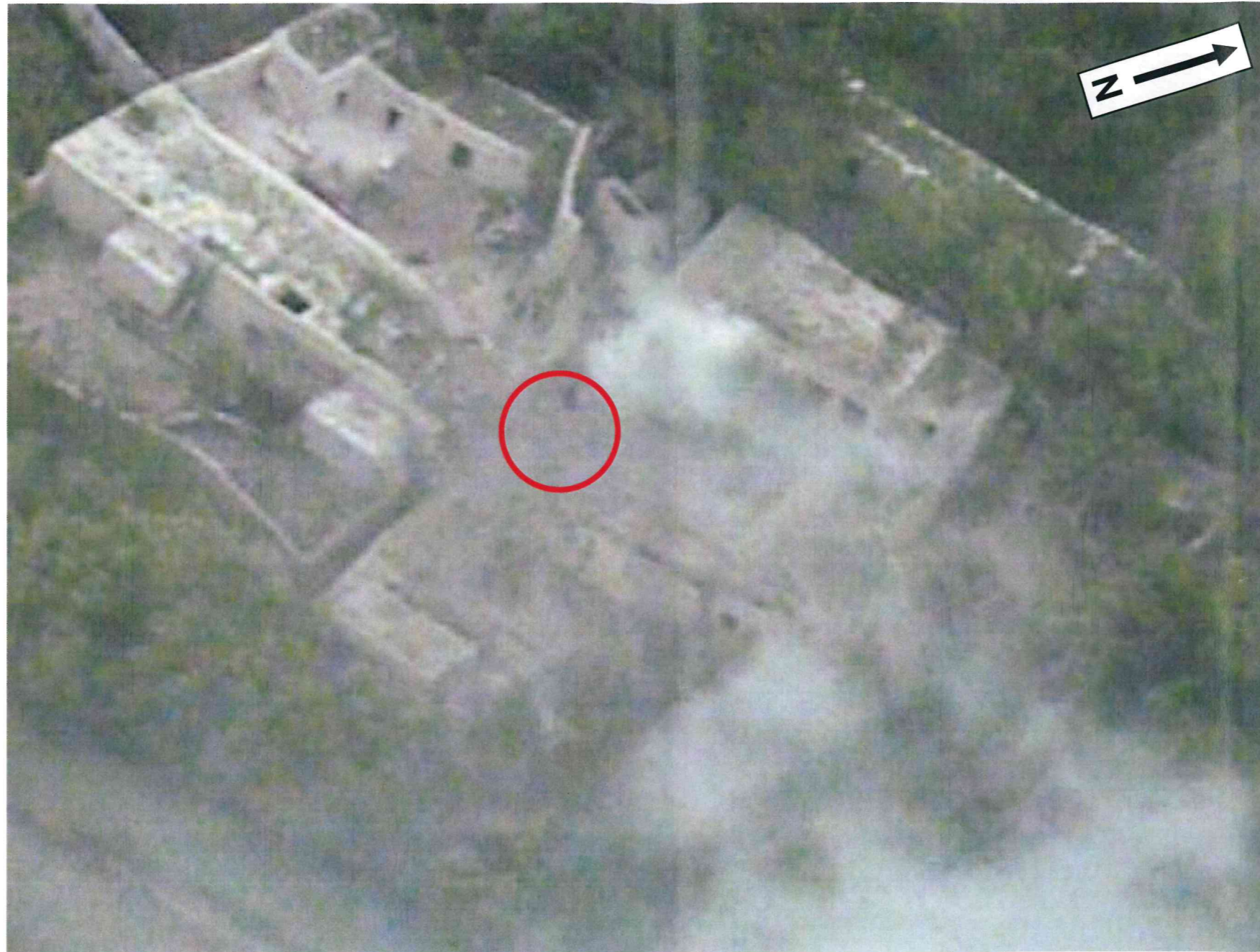
Comment: (FMV EO Still) Quala W0108 post strike. Red circle shows point of impact.