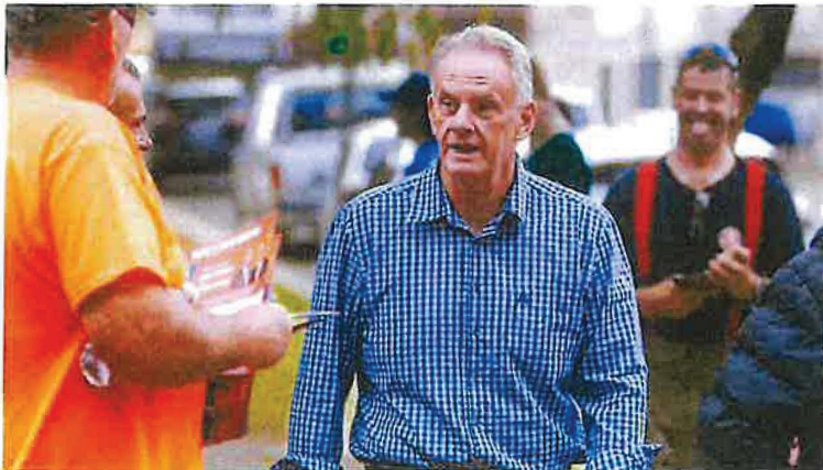
One Nation MP Mark Latham.

Mr Latham's explicit tweet — which remained online for about three hours before it was deleted — prompted One Nation boss Pauline Hanson to demand he apologise.