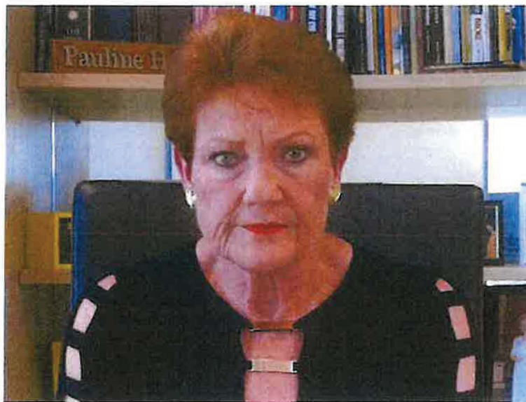
One Nation party leader Pauline Hanson has called on Mark Latham to apologise.

"I think they are disgusting. I've actually tried ring Mark a couple of times, to no avail," she said.