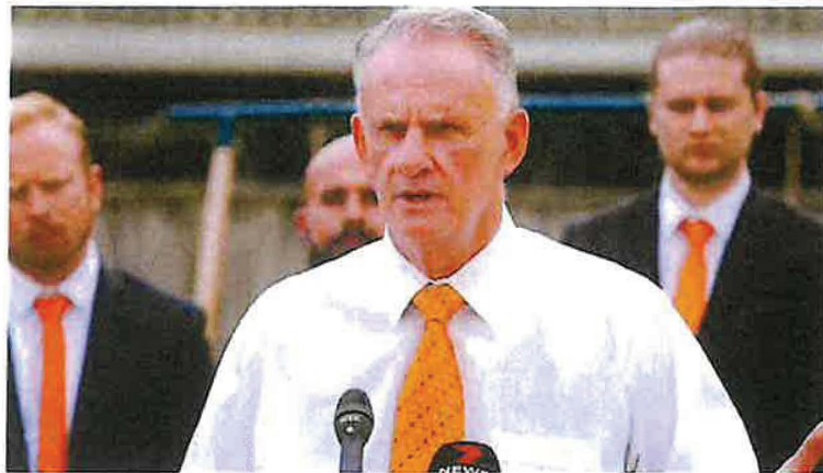
One Nation Leader Mark Latham has been criticised for his tweet.

The Daily Telegraph has chosen not to disclose the contents of the tweet due to its offensive nature.