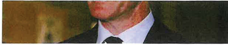
Premier Chris Minns unequivocally denounced the words of NSW One Nation Leader, Mark Latham.

Mr Minns also acknowledged that members of the LGBTQ+ community are two-and-a-half-times more likely to seek urgent medical help as a result of a mental health condition, which also motivated to speak out against Mr Latham's comments.