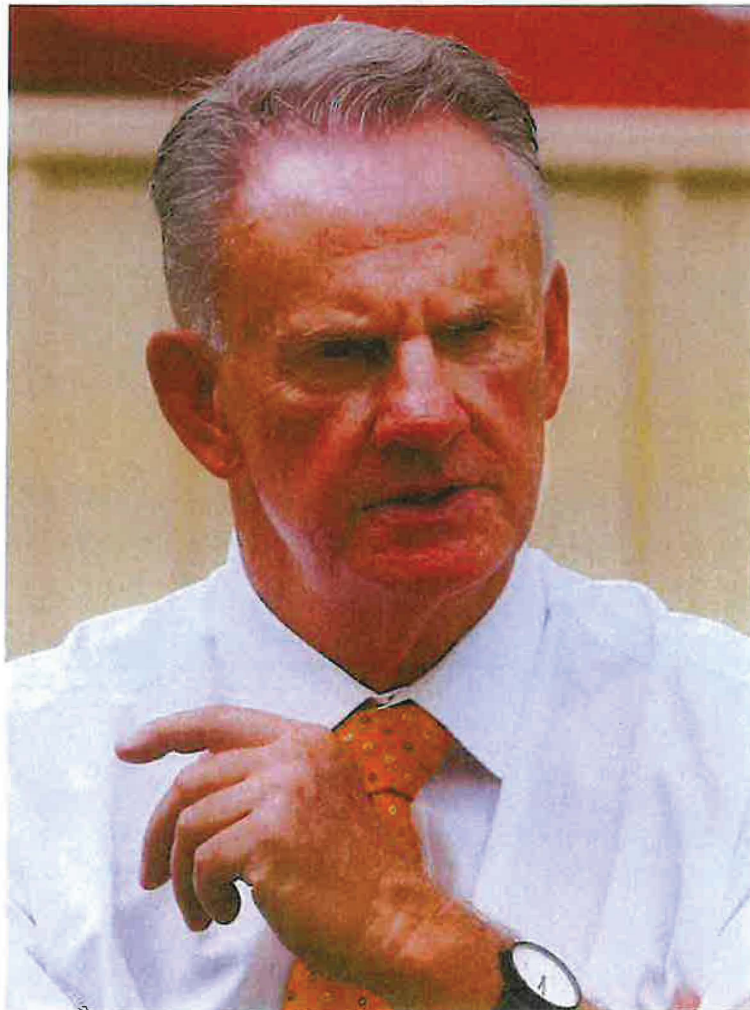
One Nation Leader Mark Latham has been criticised for his tweet.

The One Nation leader has gone to ground and not been heard from since deleting the tweet on Thursday.