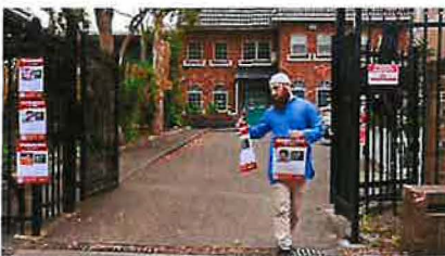
The Al-Madina Centre in Benetton.

"This continues today where we find the majority of banks are owned by the Jews who are happy to give people loans knowing that it's almost impossible to pay it back."