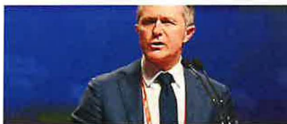
no place for Islam in Australia, local member Jason Clare, in a rare 'NSA' interview

Workplace minister Tony Burke of the nearby seat of Blaxland, said "I unequivocally condemn anti-Semitism wherever it occurs."