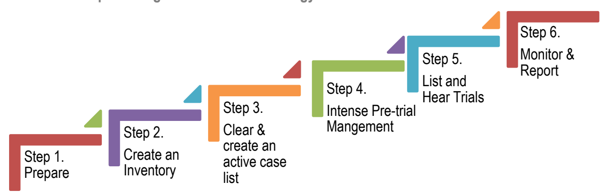
Tool 1: Six-Step Backlog Reduction Methodology

The backlog and delay reduction method presented in the Section 4 of this Toolkit present a straightforward six -phase methodology as represented in Tool 1 below.