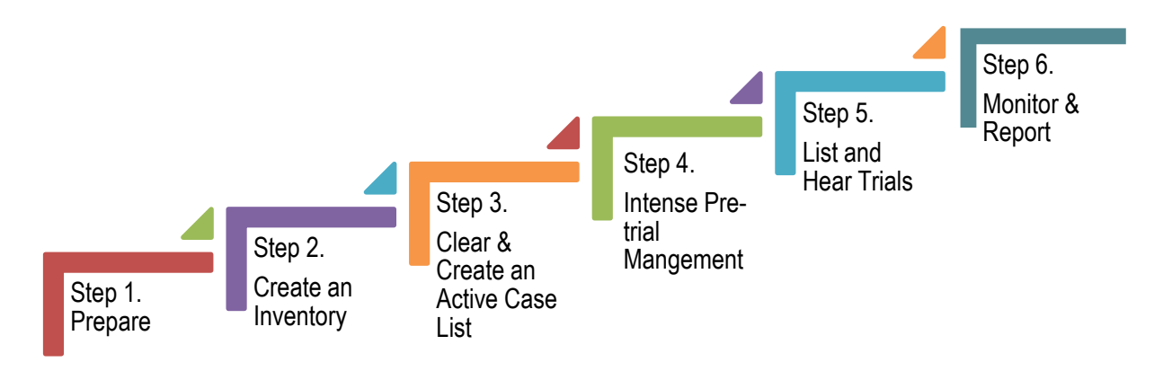
Diagram 2: Implementing the Six-Step Backlog Reduction Methodology

There are common elements of successful backlog reduction programs. Building on these common elements, this section provides you with the practical knowledge and strategies to reduce backlogged cases in six-steps that are designed especially for courts in the Pacific. Additional strategies to reduce delay will be discussed in Section 5.