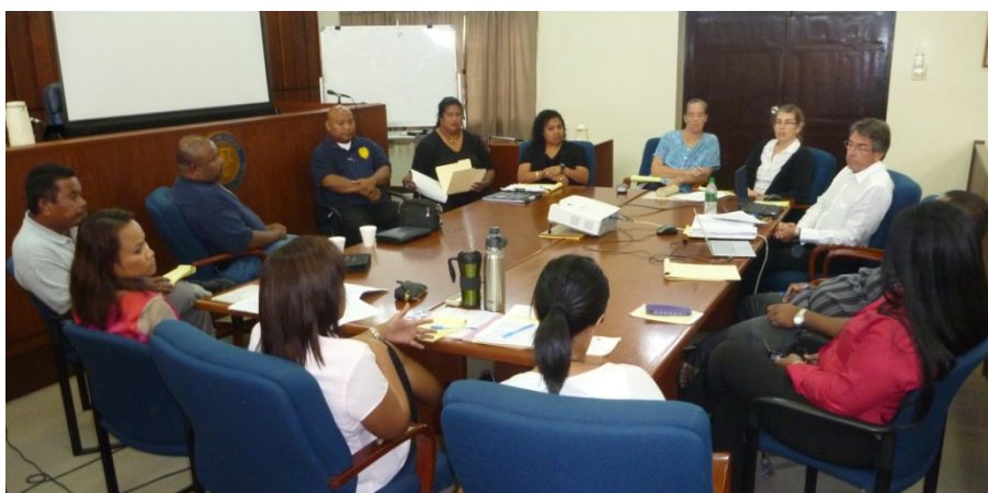
Round table discussion, Family Violence Workshop - Facilitated by Judge P. Boshier

In the MOU, participants resolved "...to set out a clear pathway for the response to this violence and to acknowledge the intention of those entering into the memorandum, and to work according to an agreed protocol." The signatories "...accept that family/domestic violence is a significant issue in Palau, and adopt the declaration entered into by the Pacific Islands Chiefs of Police of twenty Pacific nations, including Palau, on October 11, 2007."