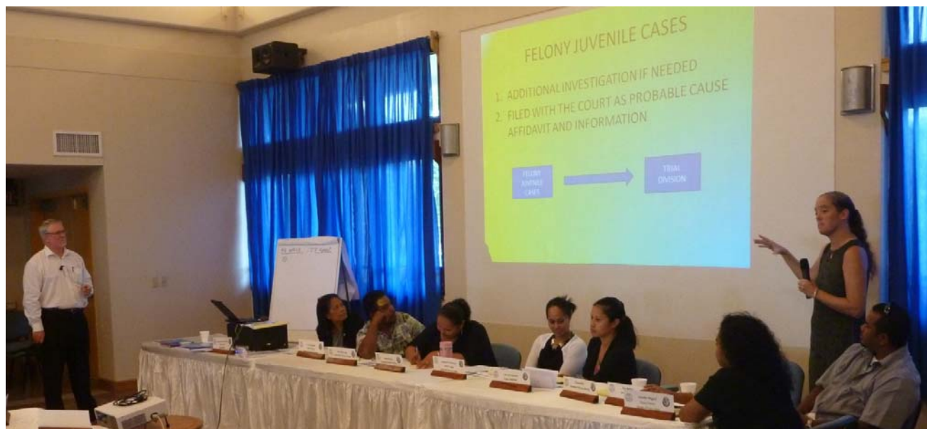
Panel discussion, Youth Justice Workshop.

The second half of the conference focused on youth justice, including: understanding brain development, successful practices in New Zealand, identification of solutions, and a discussion of action plans. At the conclusion of this portion of the conference, participants agreed upon a set of principles that could inform future legislation, including definitions of "juvenile" based on age, a desire to treat offending youths "consistent with custom and tradition," and guidelines concerning sentencing and rehabilitation of juveniles. The participants also executed an MOU that outlined specific responsibilities to improve coordination and services of agencies, including the Bureau of Public Safety, the Judiciary, and Attorney General's Office to provide greater access to diversionary programs and track progress of those efforts.