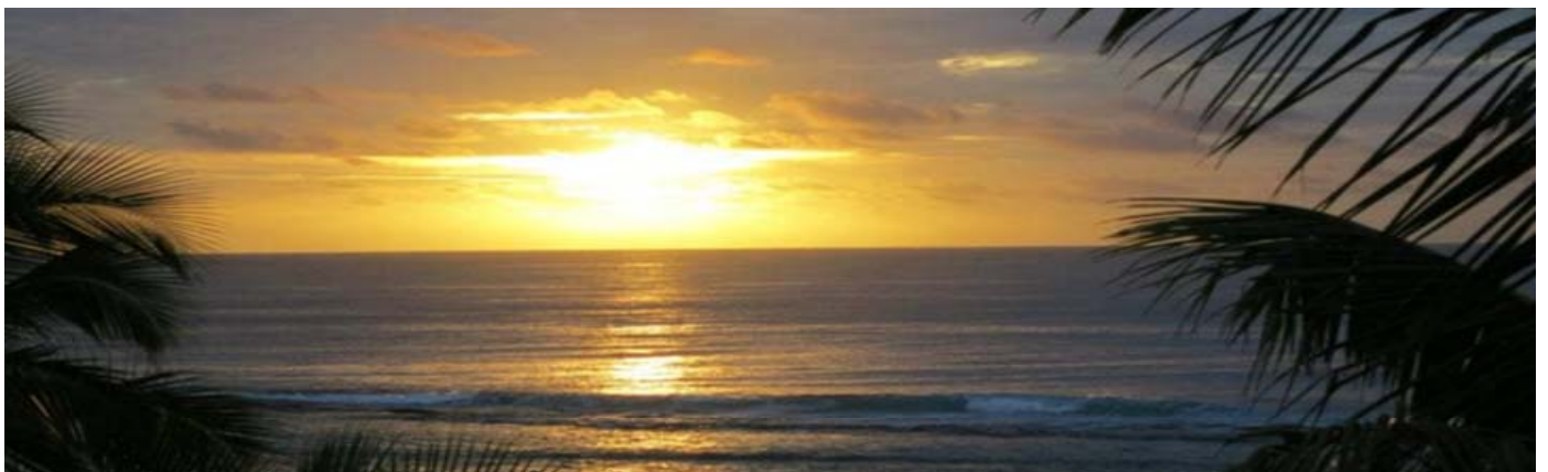
Sunset at the Additional ToT Workshop, Rarotonga, Cook Islands - 27 February-9 March, 2012